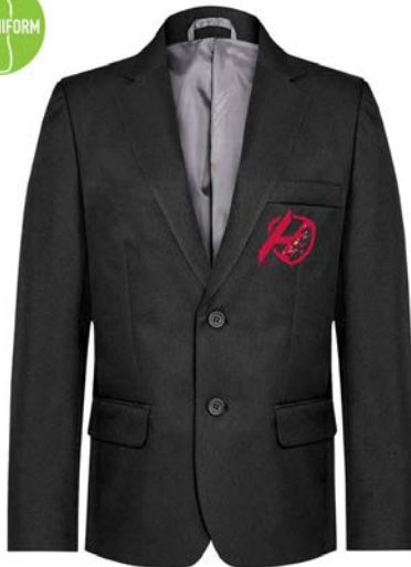
DL1995 Black Fitted Blazer C/w Embroidered Badge