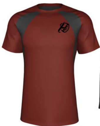
Unisex PE Encore Performance T-Shirt