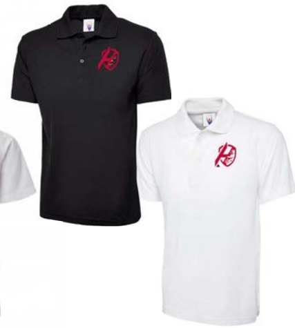
Optional Summer Polo. Only to be worn from MAY half Term