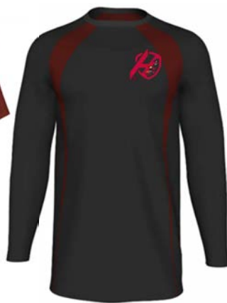
Unisex PE Encore ZR42 Sweat Shirt