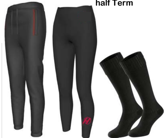
Unisex ZR45 Pants DL7002 7/8 Leggings Leggings to be worn undershorts or for dance.