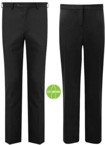
Only Black Trousers To Be Worn