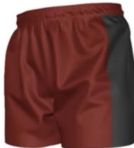
Unisex PE ZR50 Performance Shorts