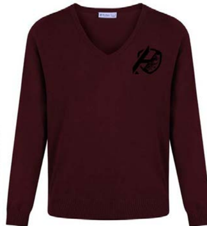
M,Fit Maroon Unisex Jumper C/w Embroidered