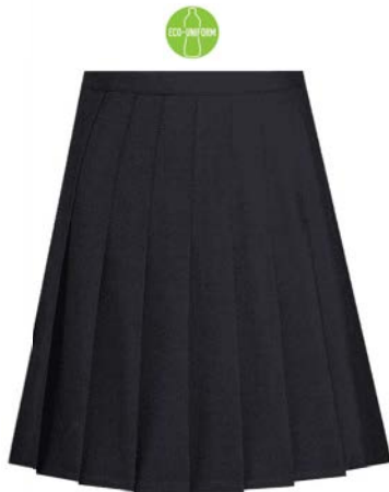
Only Black DL972 Skirt To Be Worn.