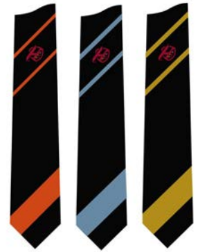
September 2023 Year 9 Year 10 Year 11 2023 52" Standard Year Tie