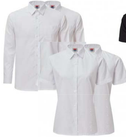
White, Long Sleeve Or Short Sleeve, Shirts Or Blouses